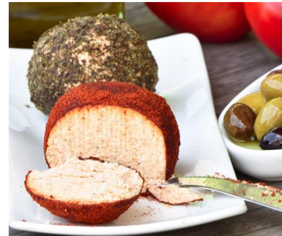
Shankleesh (Aged hard cheese)