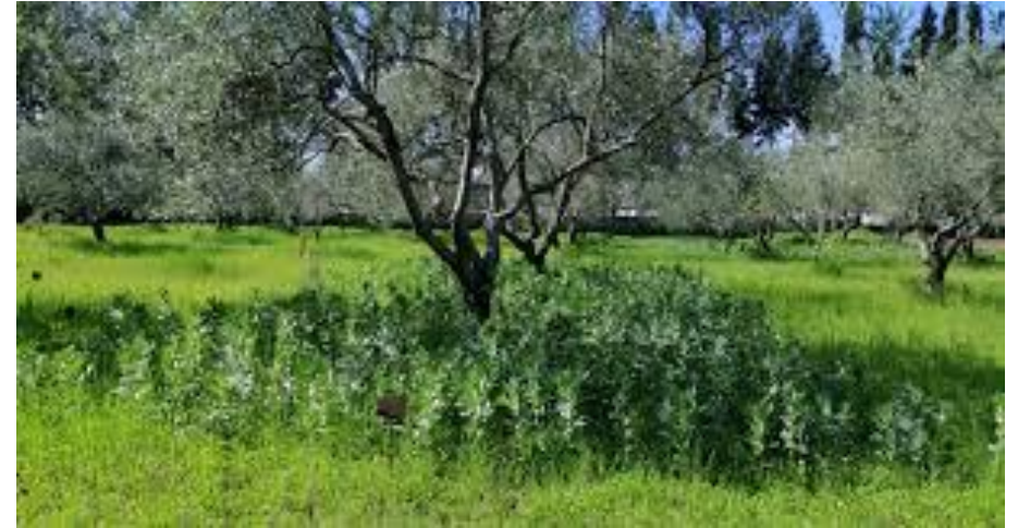
Living Agro – PRIMA project