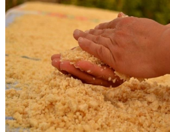
Kishk (Fermented mix of cracked wheat and yoghurt)