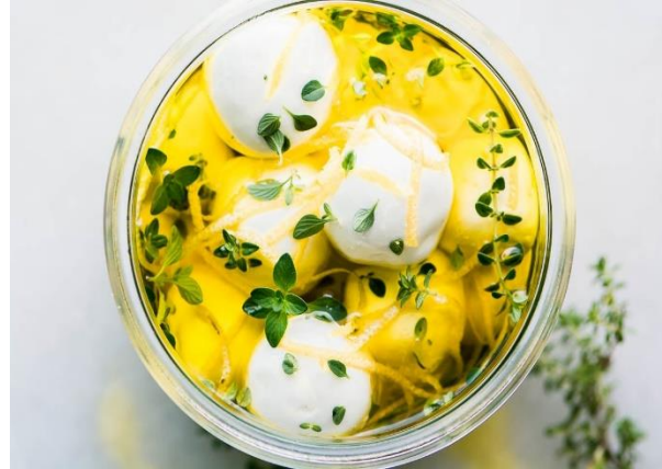
Labneh (a tangy cream cheese)