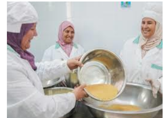
Women cooperatives, MountainHer – PRIMA project