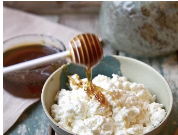
Dariyeh and Aricheh (Cottage cheese)