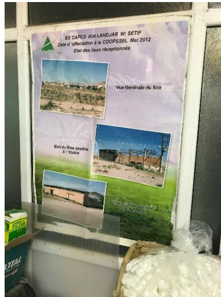
Picture n° 4 : The buildings of the « Ain Lahdjar » farm before its re establishment