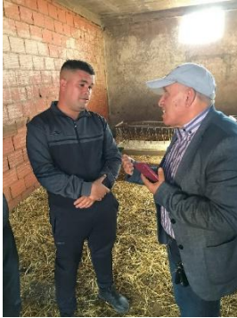
Discussion with a breeder