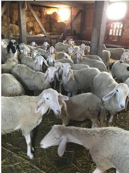
The Ouldjedal breed herd