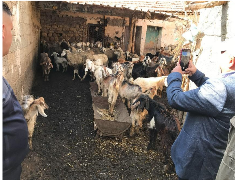
The Berber breed herd