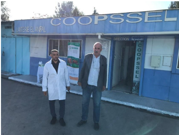
Picture n°1 : The entrance of the cooperative with his President and the cheese manufacturer manager

Initially, COOPSEL was created in 1980 to ensure the supply of production resources essential to the agricultural and livestock activities provided for in the PNDA. After several changes of status, it became the multipurpose cooperative "El Anfel" in 2020. It has 1,330 members but also works with non-member breeders. COOPSEL has focused on milk production and collects 19 million liters of milk from 700 producers of varying sizes (some units have up to 300 heads). The challenge is to produce quality fresh thermized milk capable of competing with reconstituted milk from powdered milk produced by the central dairy, as well as Lben, but also to diversify, for example, with the manufacture of cheese (uncooked pressed cheese, Gouda type). The price paid to the producer is 60 DA per litre (0.4€/l) variable by 5 DA/l depending on the quality of the milk.